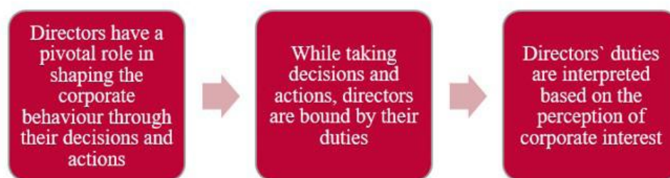
Figure 3 Relationship Between the Key Concepts of Corporate Interest and Directors' Duties

The first identified problem specifically deals with directors' duties. It states that 'directors' duties and company's interest are interpreted narrowly and tend to favour short-term maximisation of shareholders value' (emphasis added). Therefore, it identifies the interpretation of these two concepts ((i) directors' duties and (ii) company's interests) as a single combined cause that favours shareholder interests. It seems like the choice of making a combined statement with these two elements was a deliberate decision.